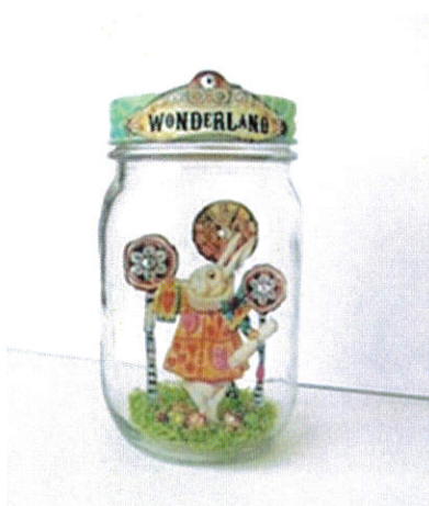
Alice in wonderland